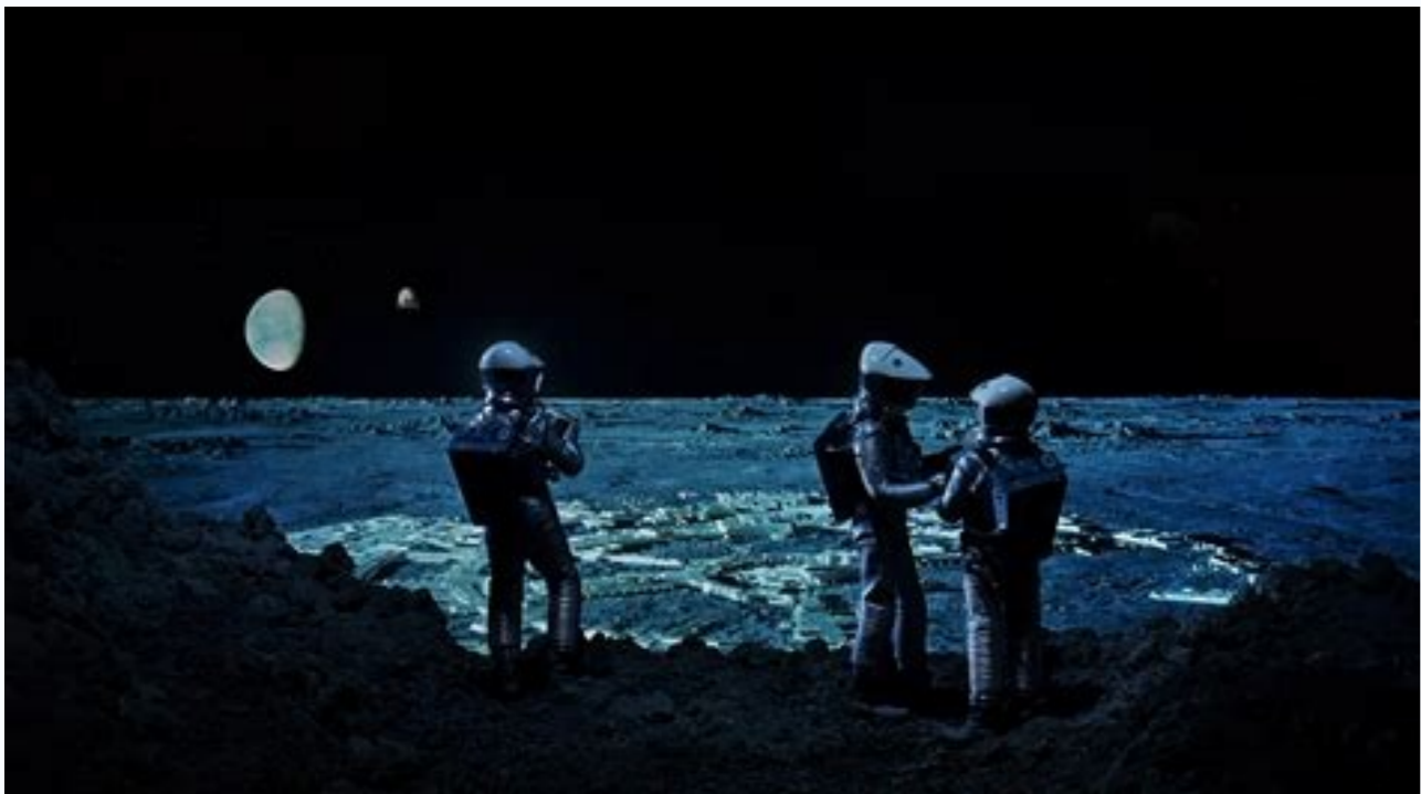
2001 a space odyssey theme song (also sprach zarathustra). Children's orchestra plays the theme song from 2001 a space odyssey. 2001 a space odyssey theme song composer. Space odyssey theme song download. Space odyssey theme song mp3 download. Space odyssey theme song trumpet. Who wrote 2001 space odyssey theme song. Space odyssey theme song ringtone download.

Copyright 2005 © Symphony Brass Quintet, U.S.A. Publications